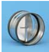
CAR Backdraft Damper