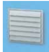
PER Plastic louver shutter