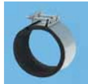
ACOP-VENT Antivibrating coupling