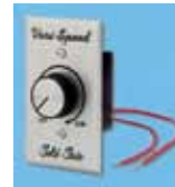
SC 15 Variable speed control

Please refer to the S&P Group A (Residential/Light Commercial) catalog for a complete line of accessories.