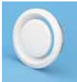
BOC Interior Air Valve