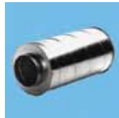
SIL Sound Attenuator